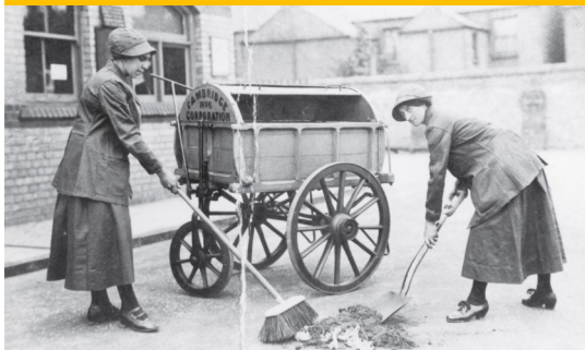
A photograph from the collection

Discover the little-known vital and heroic roles played by Cambridge women in WWI through photographs, curated from private collections and local archives. The role of women during WWI in Cambridge, especially those who remain unnamed, is relatively little known. In compiling this display, we were sensitive to the danger of perpetuating the 'sock knitting' image of women's voluntary action during this period. Yes, many did knit, but that was not all they did. Cambridge women were highly active with 'hands-on' help in not only making things for the war effort, but also in administering to the injured, in boosting the morale of those fighting in Europe, in supporting refugees and in taking on 'men's work' as well as carrying on with their own.